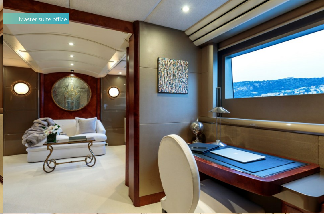
Master suite office