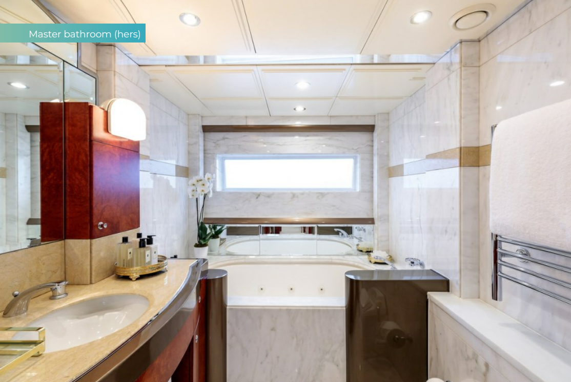
Master bathroom (hers)