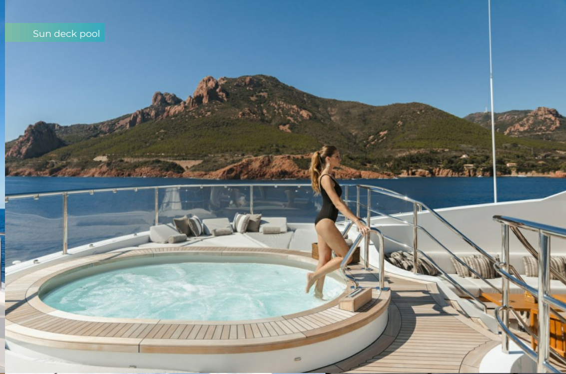
Sun deck pool