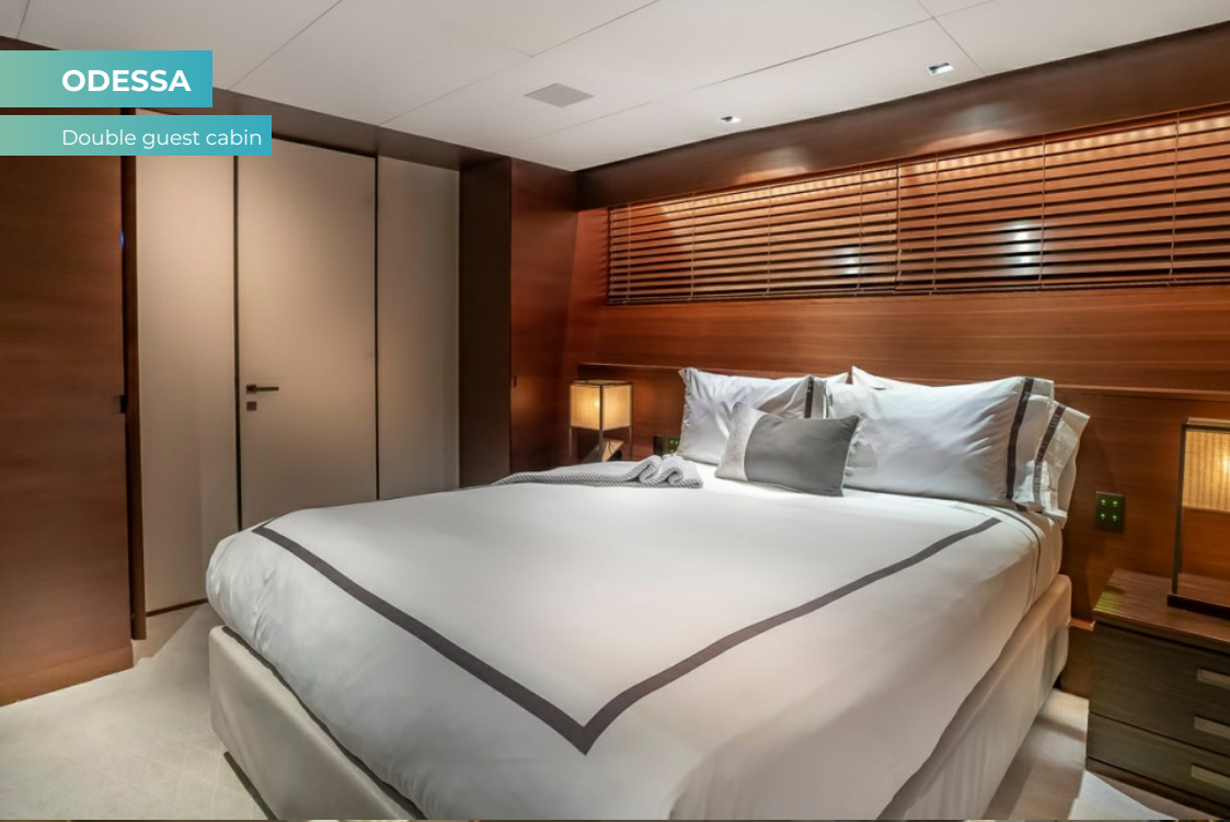
Double guest cabin