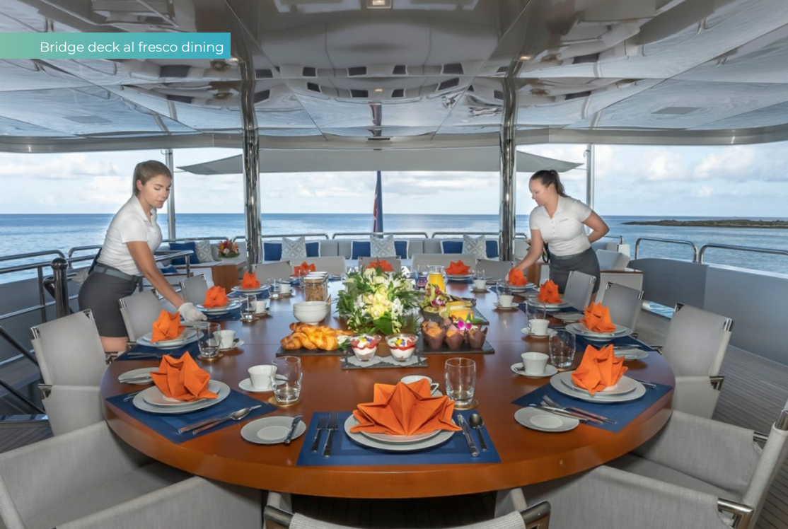
Bridge deck al fresco dining