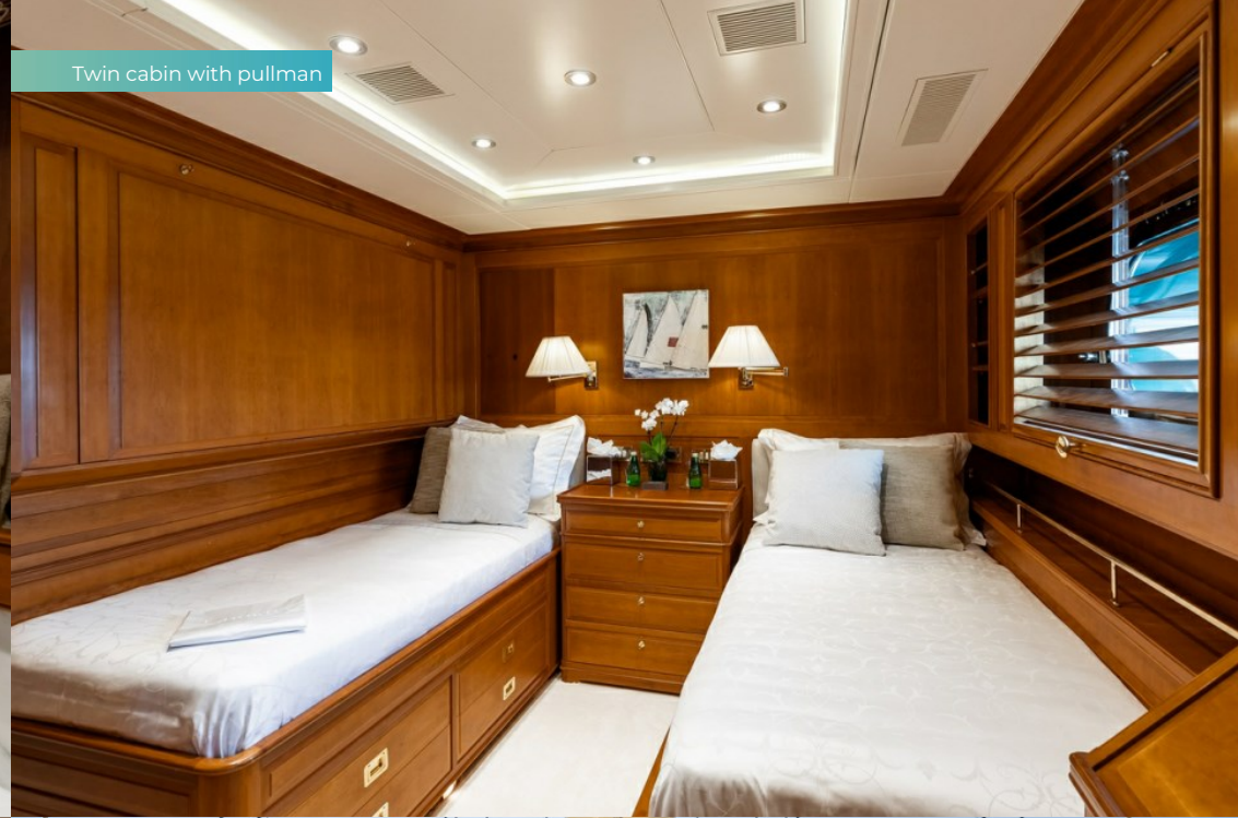
Twin cabin with pullman