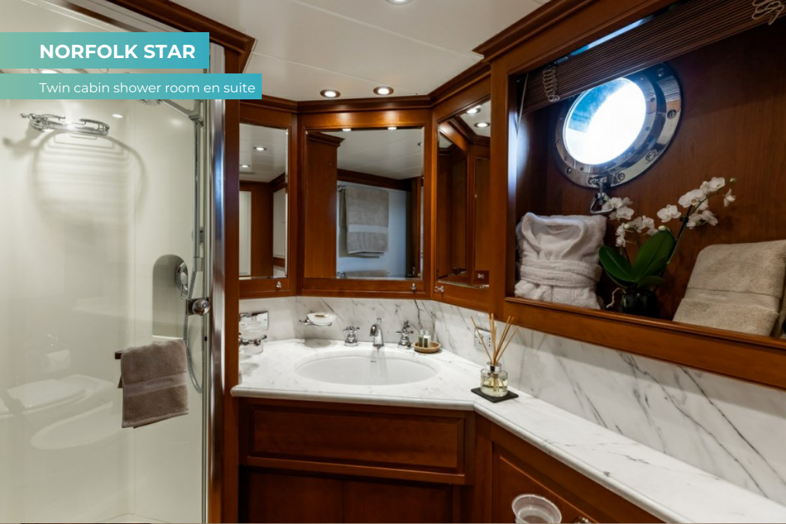
Twin cabin shower room en suite