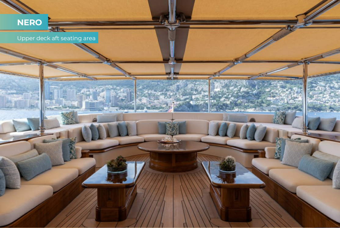
Upper deck aft seating area