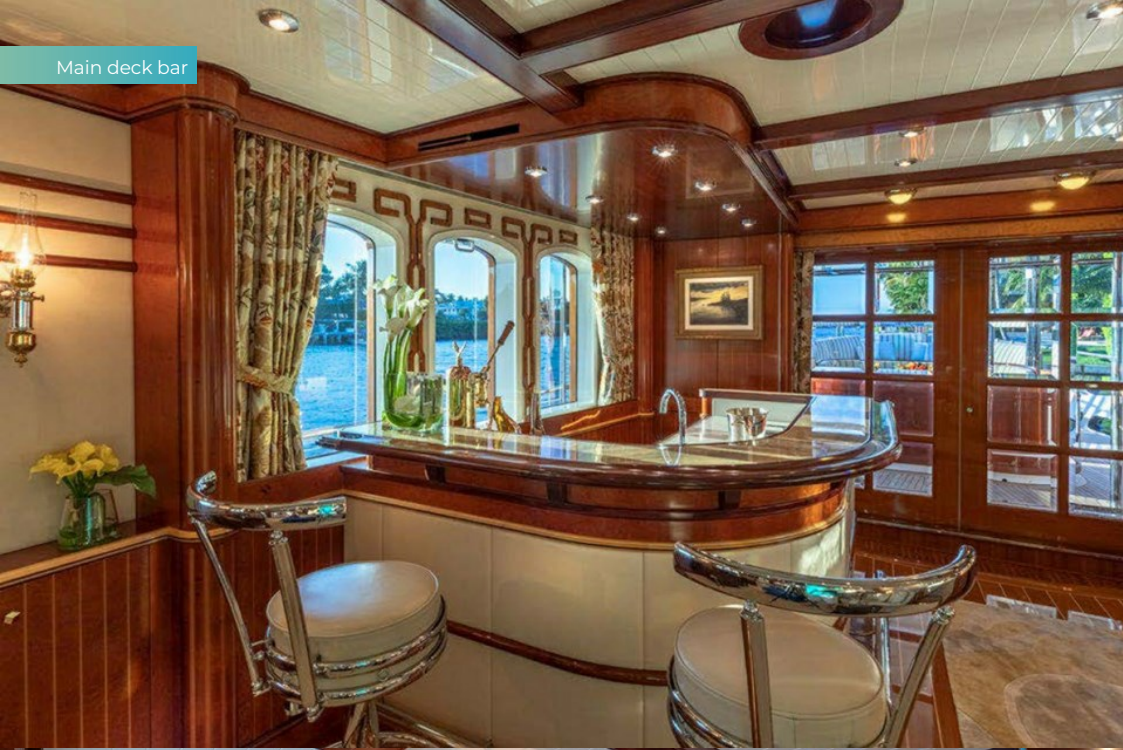
Main deck bar