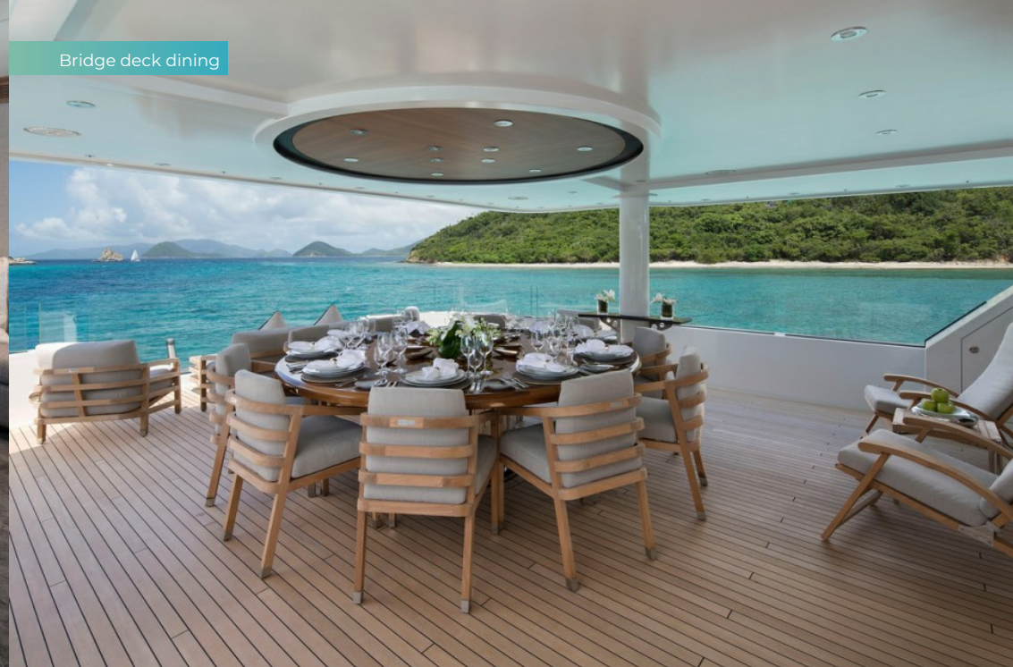
Bridge deck dining