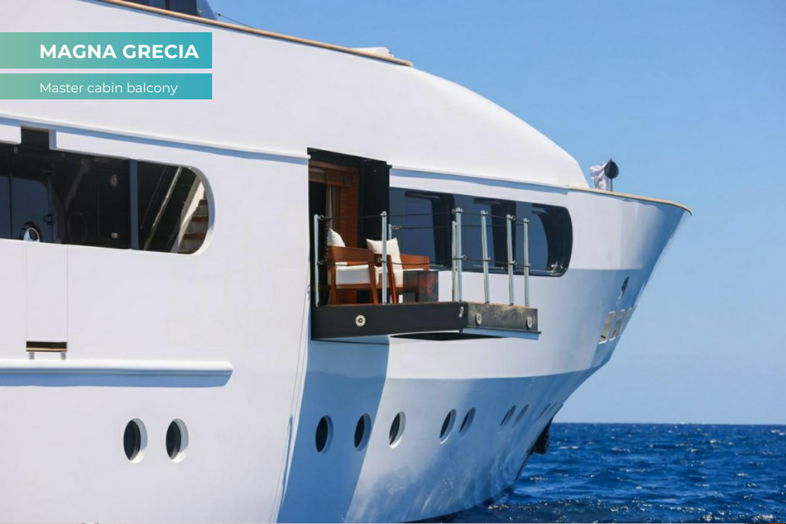
Master cabin balcony