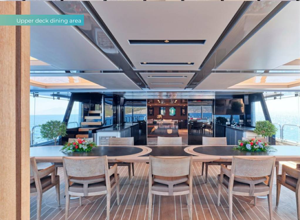
Upper deck dining area