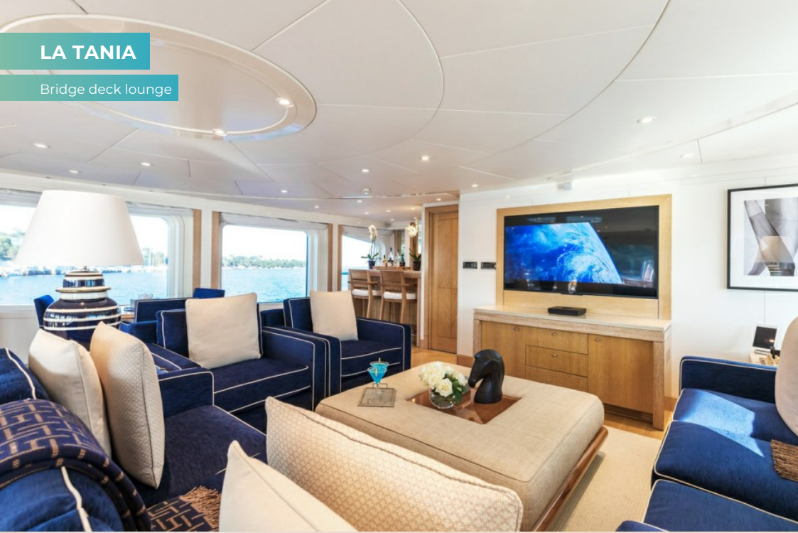
Bridge deck lounge