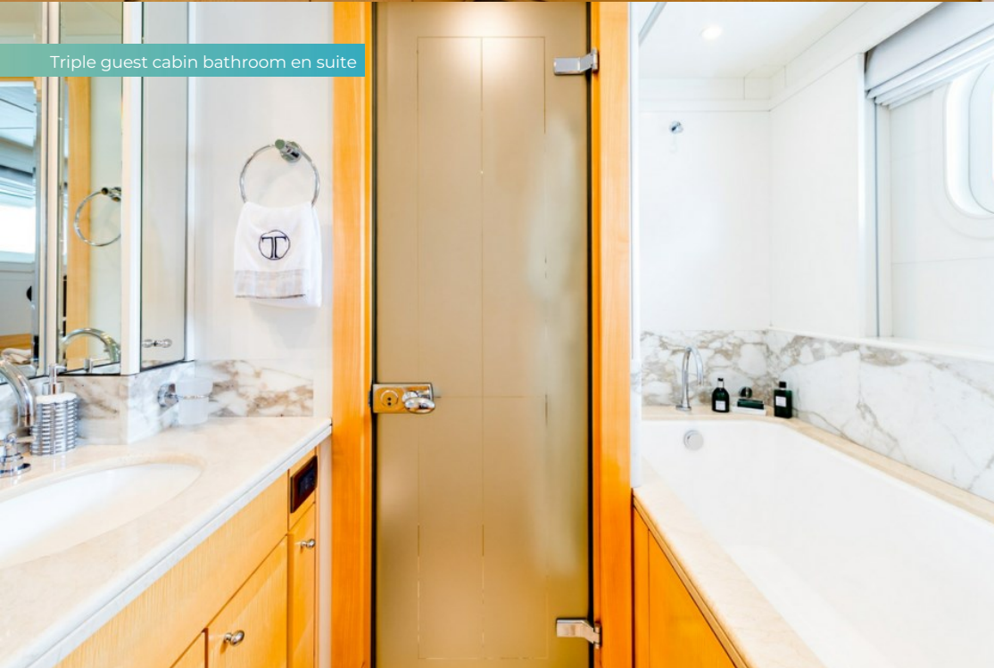
Triple guest cabin bathroom en suite