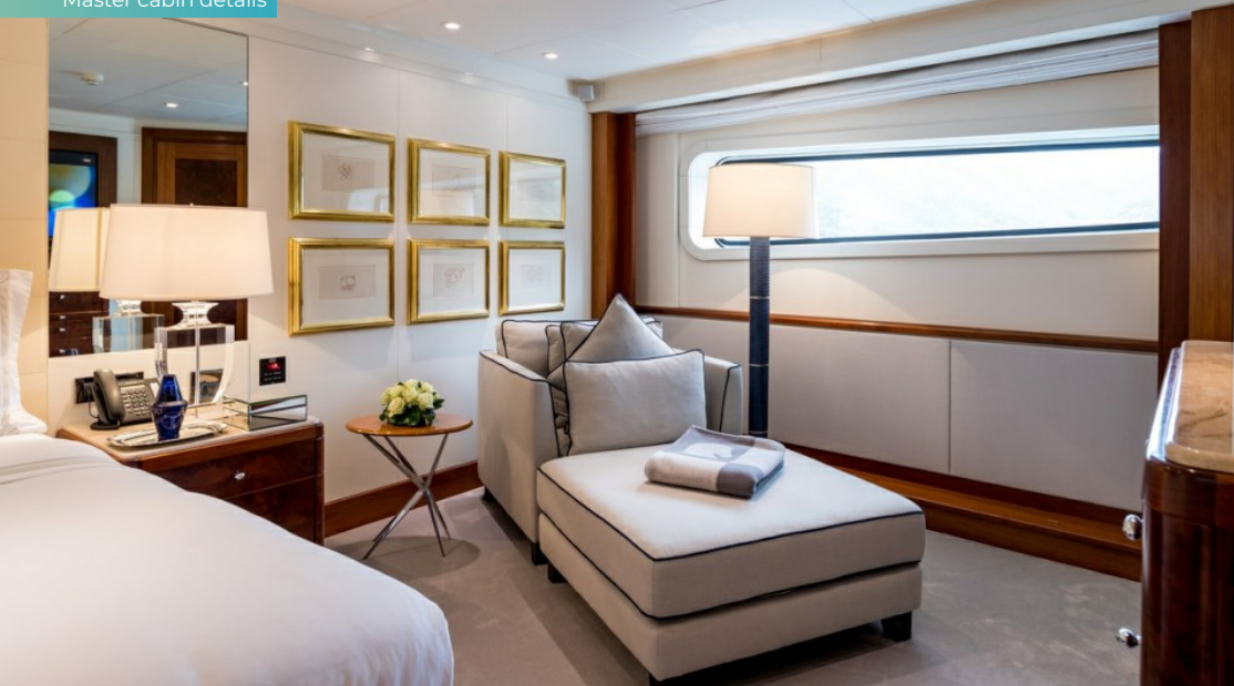
Master cabin details