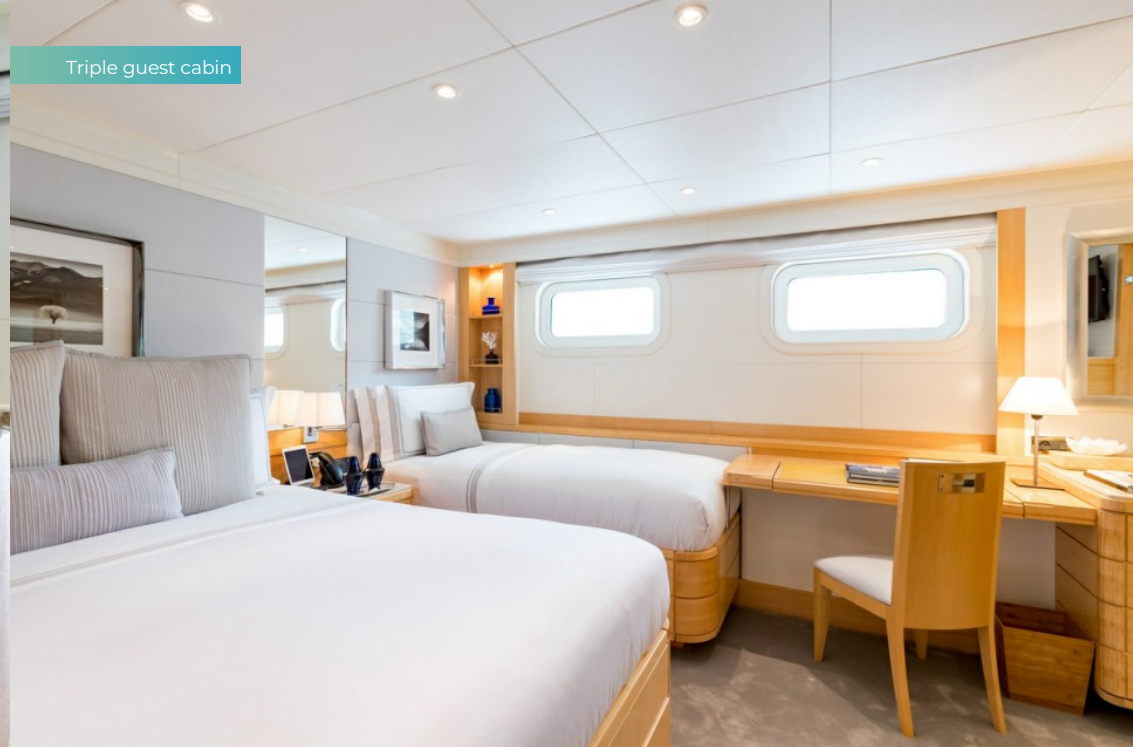
Triple guest cabin