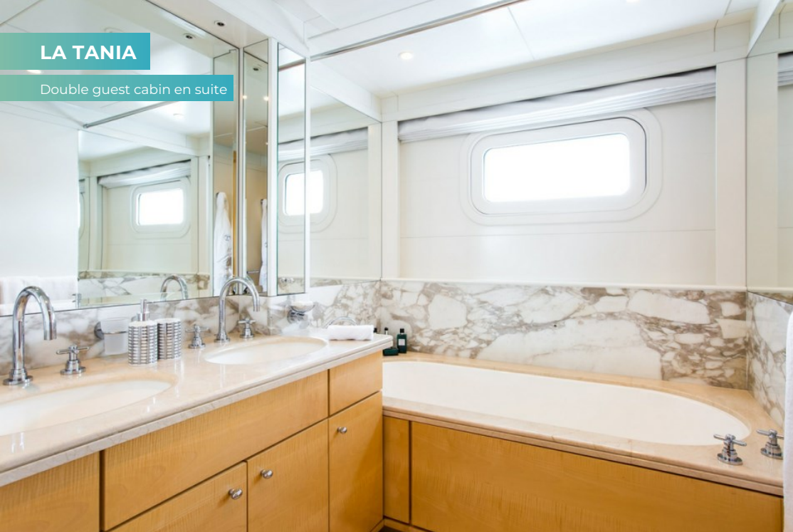
Double guest cabin en suite