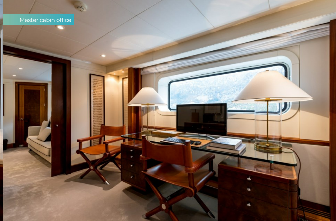
Master cabin office