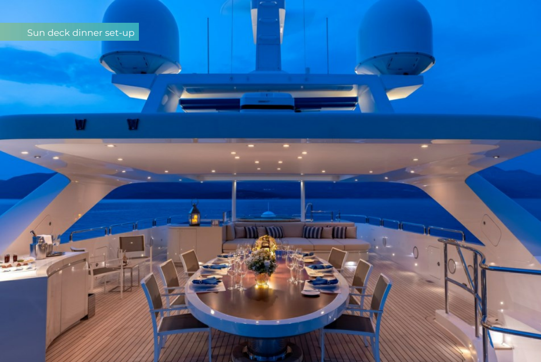
Sun deck dinner set-up