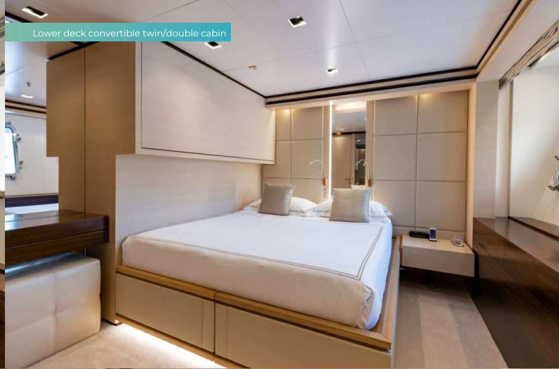
Lower deck convertible twin/double cabin