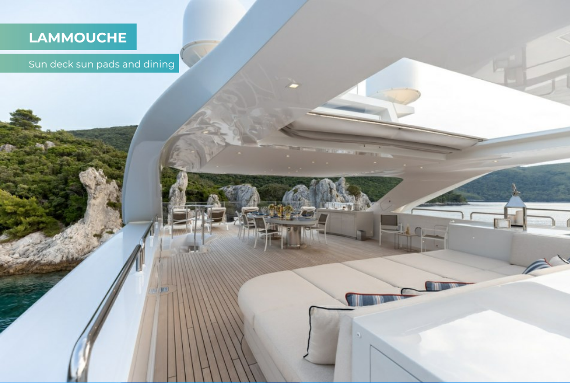
Sun deck sun pads and dining