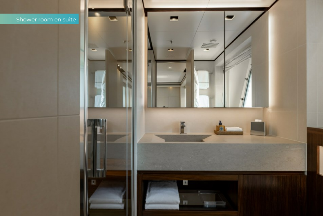
Shower room en suite