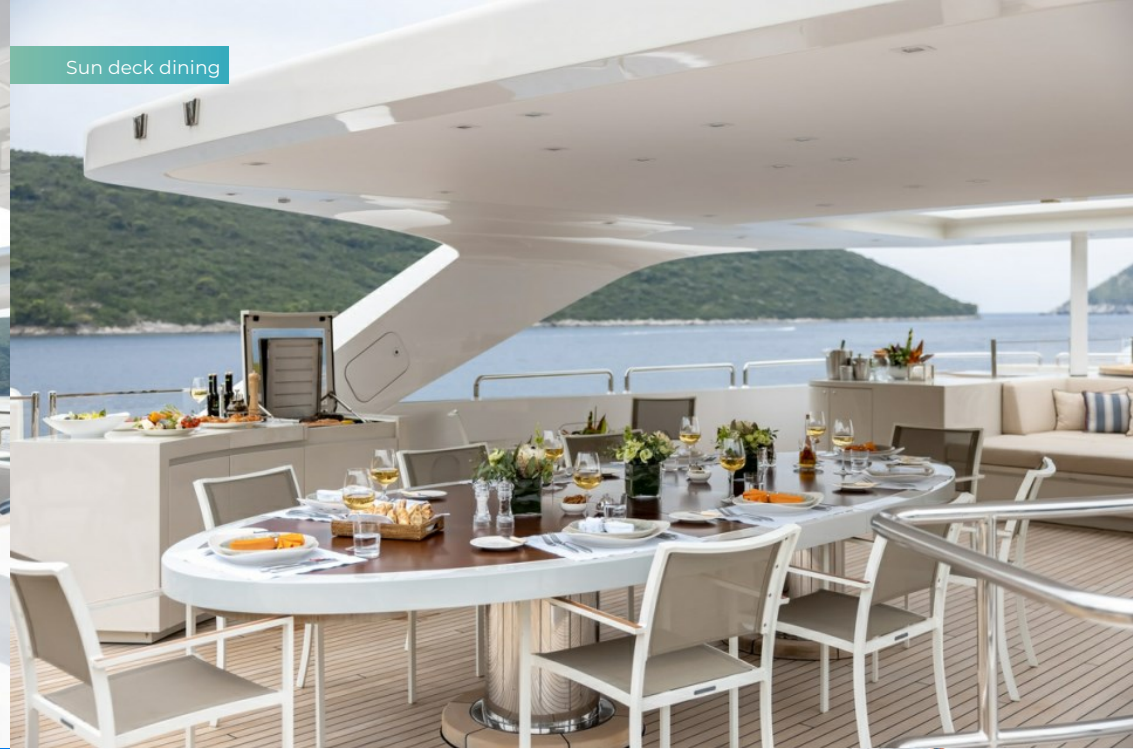
Sun deck dining