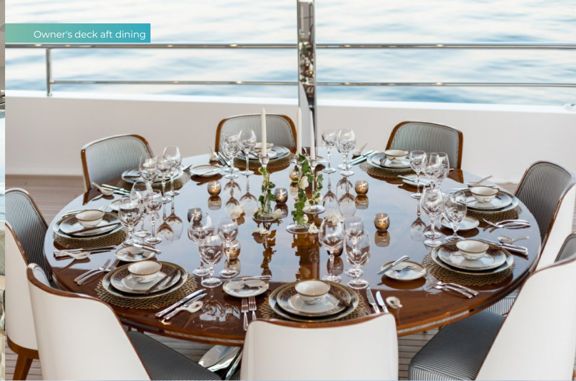
Owner's deck aft dining