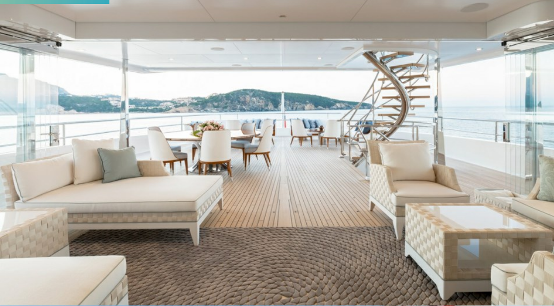
Owner's deck aft