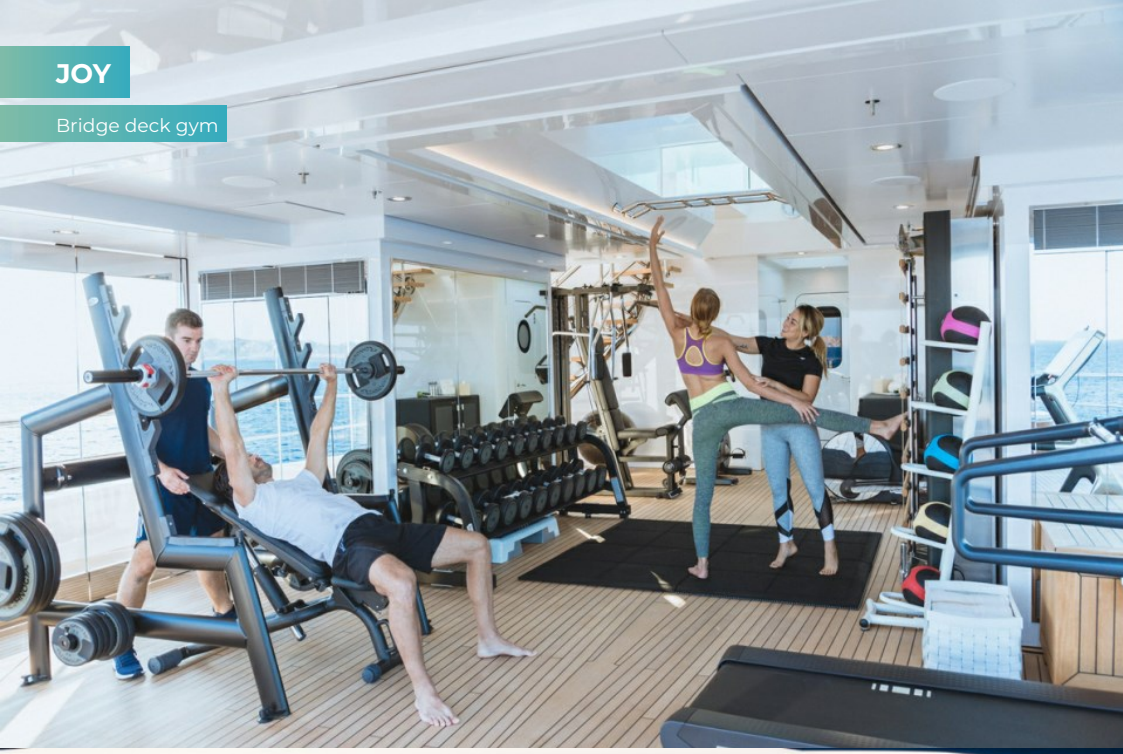
Bridge deck gym