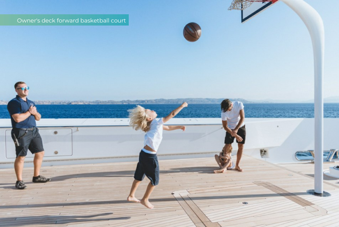
Owner's deck forward basketball court