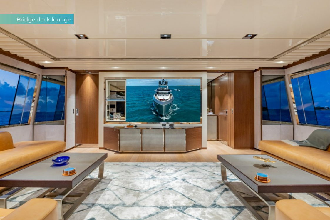
Bridge deck lounge