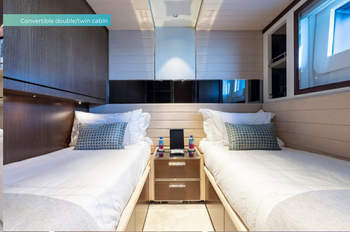
Convertible double/twin cabin