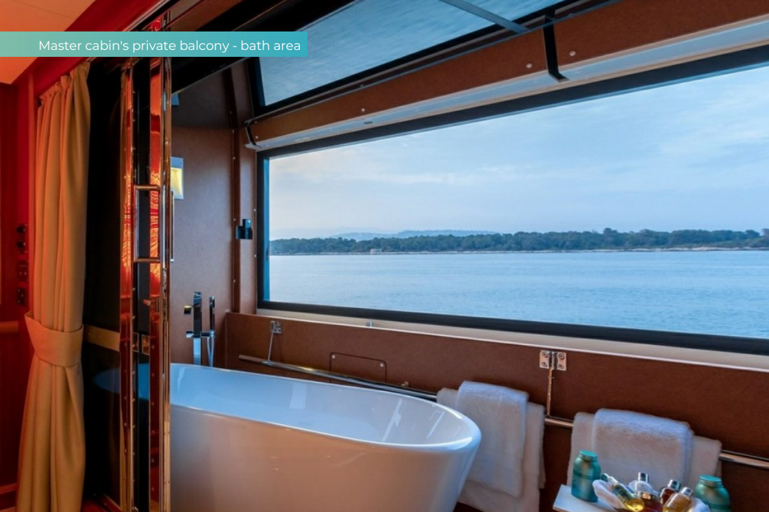
Master cabin's private balcony - bath area