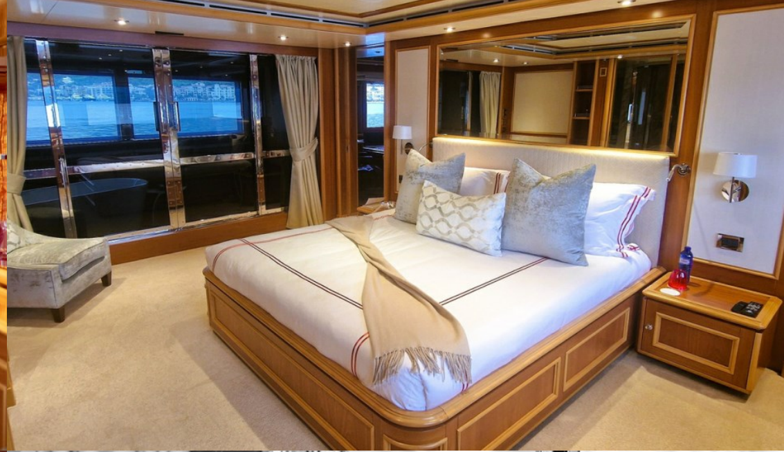
Master cabin with private balcony