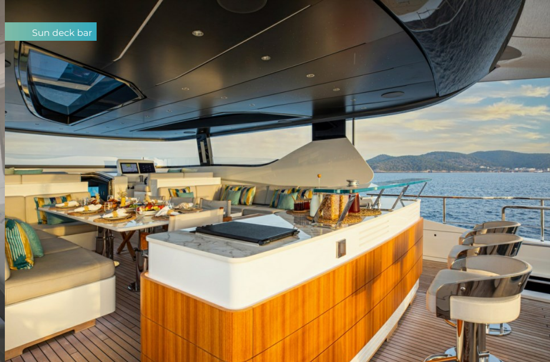
Sun deck bar