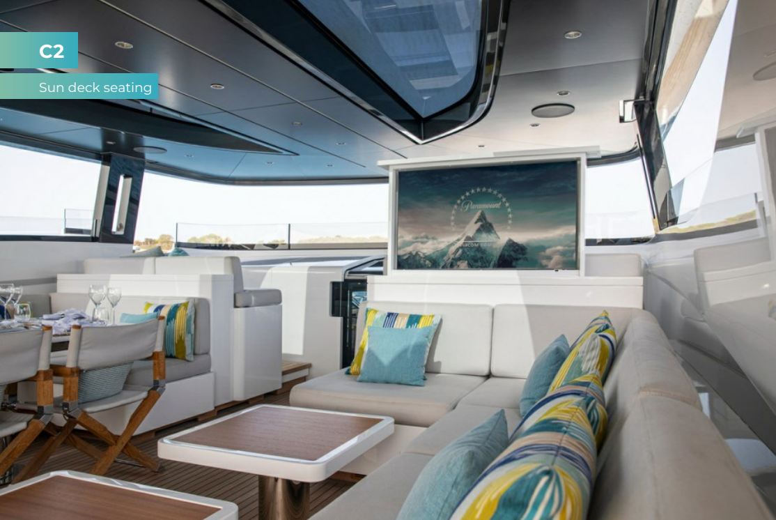
Sun deck seating