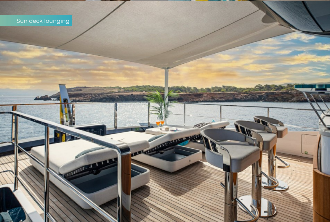
Sun deck lounging