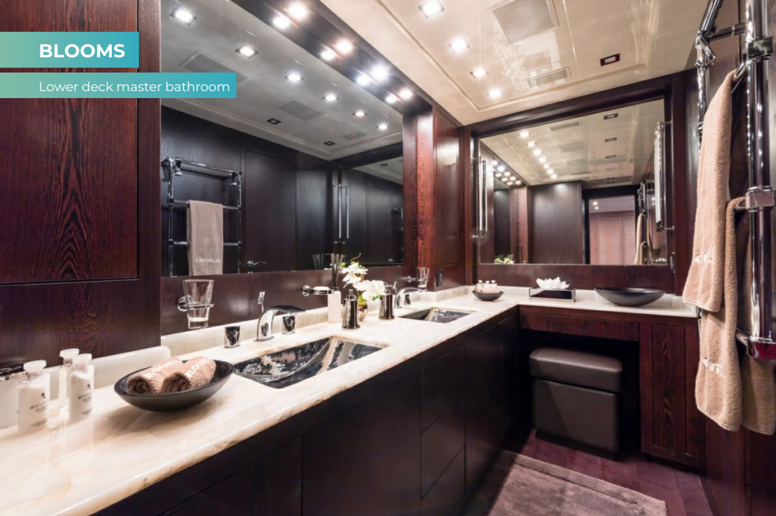
Lower deck master bathroom