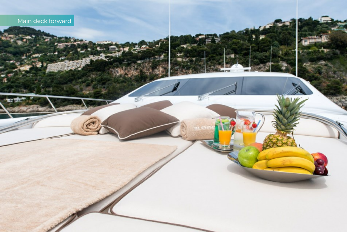
Main deck forward