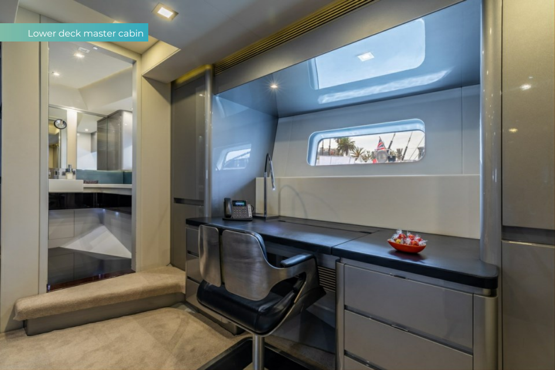
Lower deck master cabin