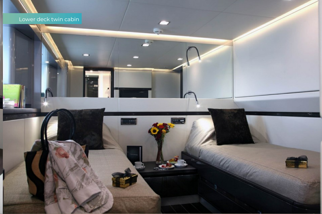
Lower deck twin cabin