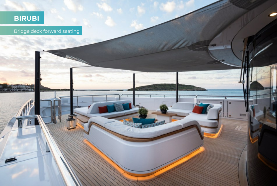
Bridge deck forward seating