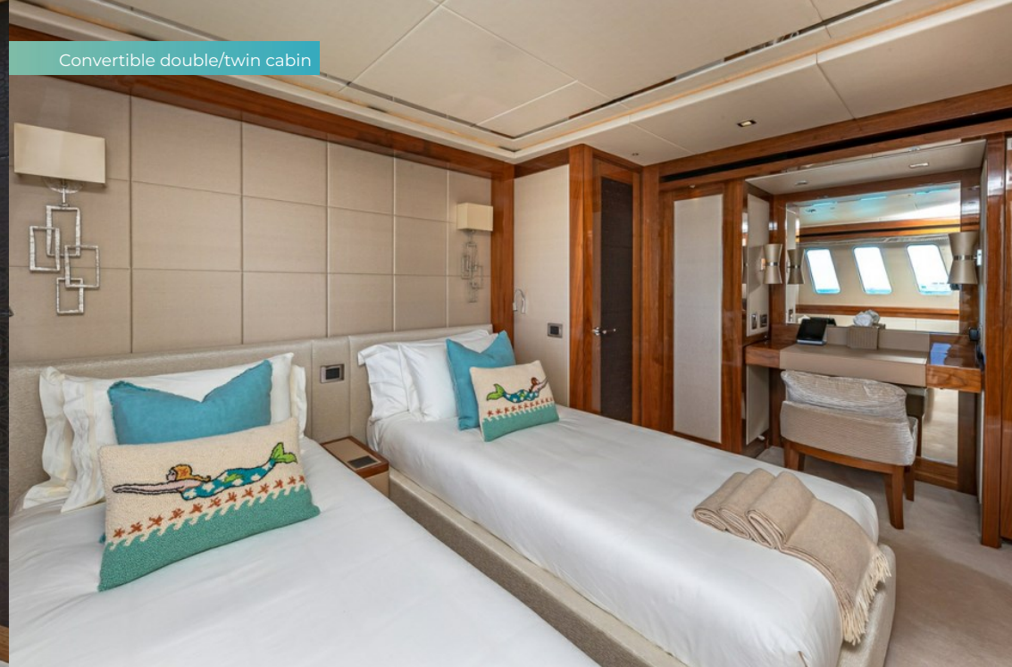
Convertible double/twin cabin