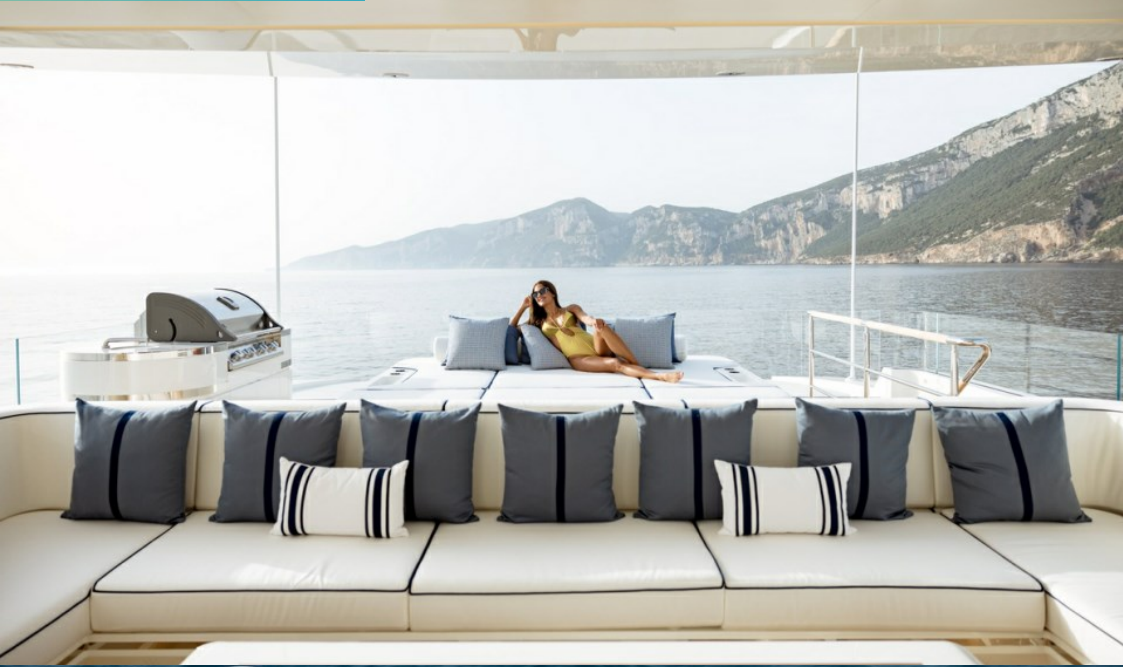
Sun deck aft BBQ & seating area