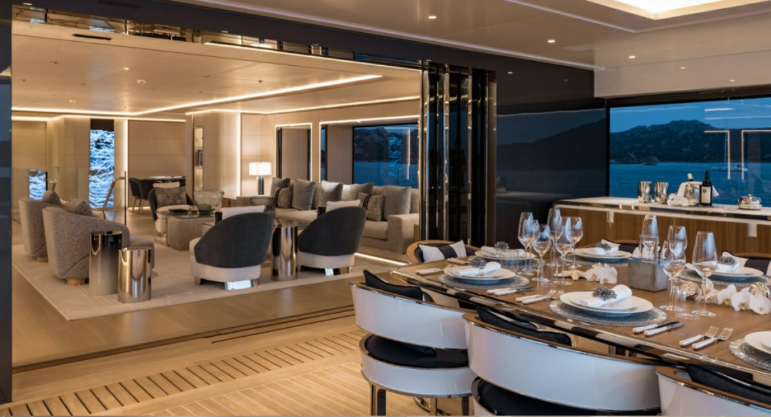
Bridge deck at night