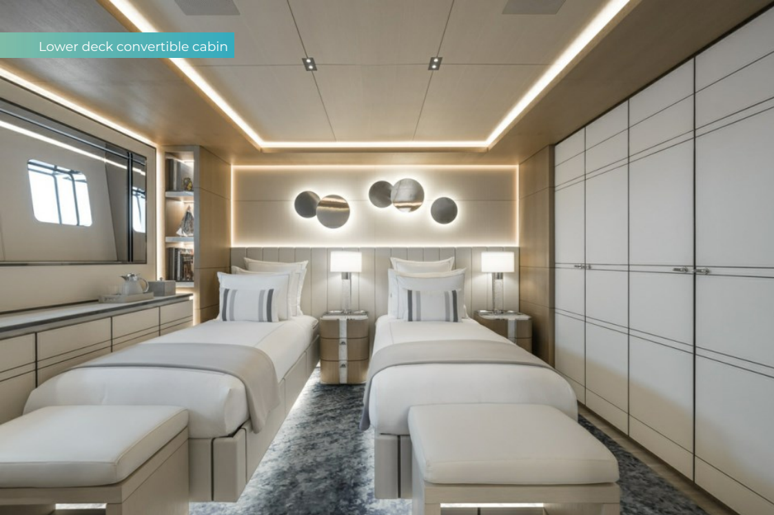
Lower deck convertible cabin