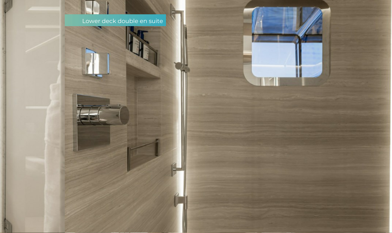
Lower deck double en suite