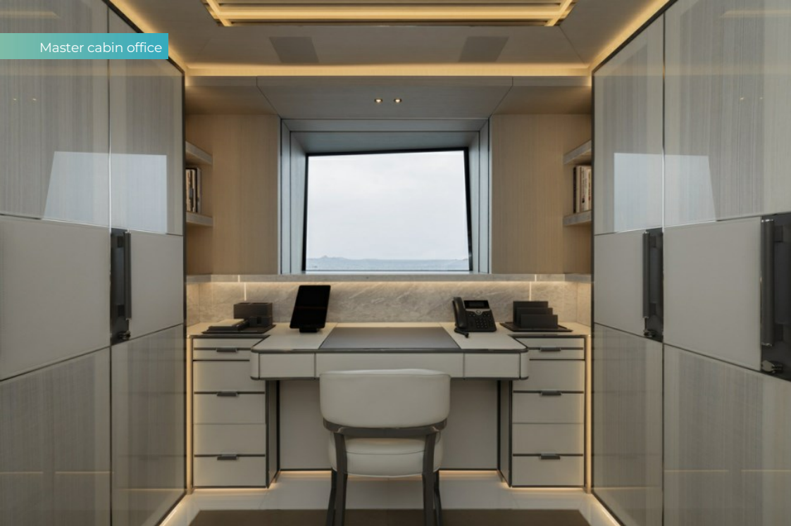
Master cabin office