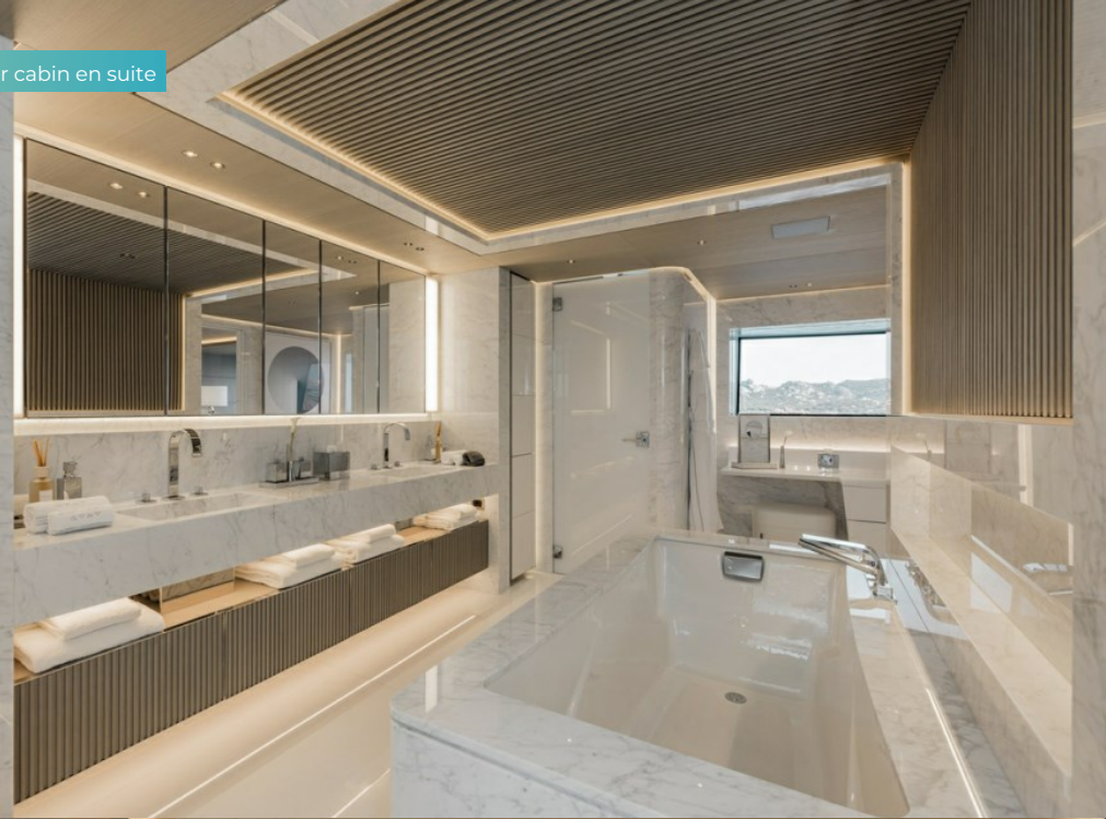
Master cabin en suite