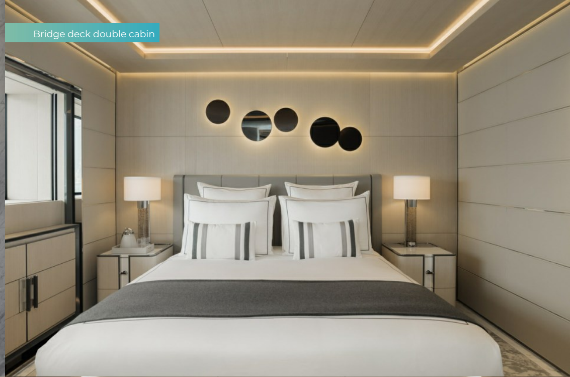
Bridge deck double cabin