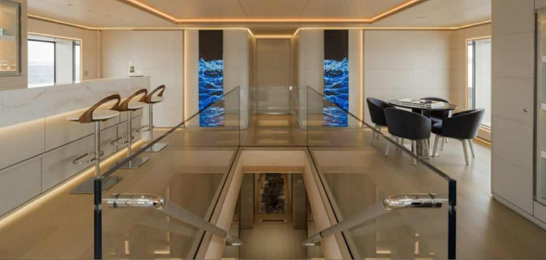
Sky lounge bar