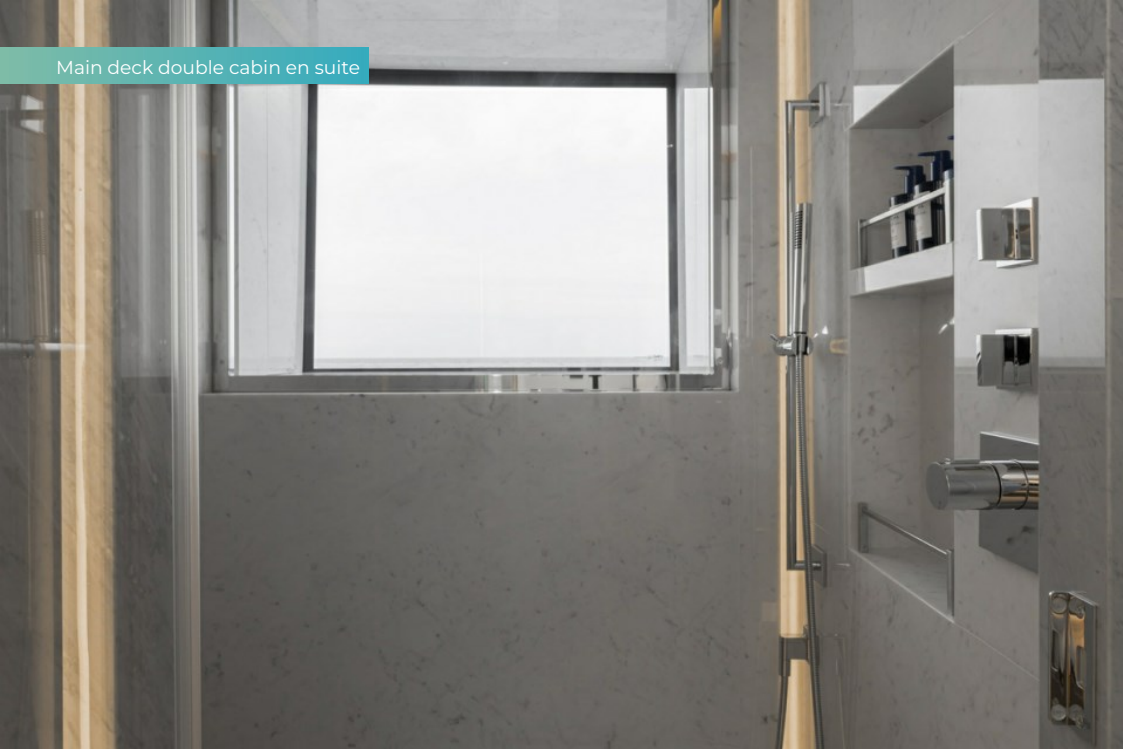
Main deck double cabin en suite