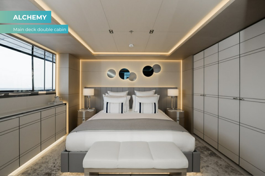
Main deck double cabin