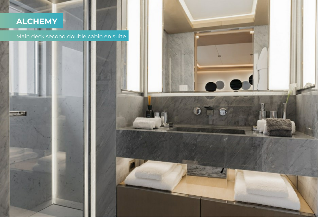
Main deck second double cabin en suite